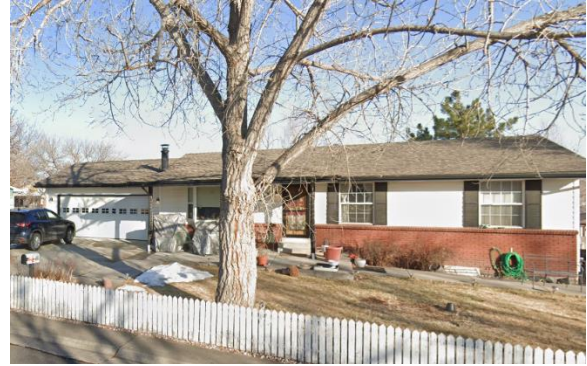
5834 Oak St., Arvada CO